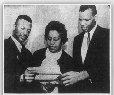
WHY CHARTER - Officers of the

The W.H.Y. (Working Hopefully for Youth) Committee was founded in early September, 1965 in order to supplement the then-latent Kingsport N.A.A.C.P. Although the N.A.A.C.P. had been largely inactive for years, many members of Kingsport's Black community felt that racial discrimination was widespread in the city & that they needed to organize in order to address that discrimination. Although W.H.Y. did not remain active for longer than two or three years, the was nevertheless committee monumental importance in maintaining the local struggle for Civil Rights and reinvigorating the N.A.A.C.P. 's activity in the mid-twentieth century.