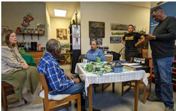
Rendville, OH Residents visiting Scott's Run Museum, WV