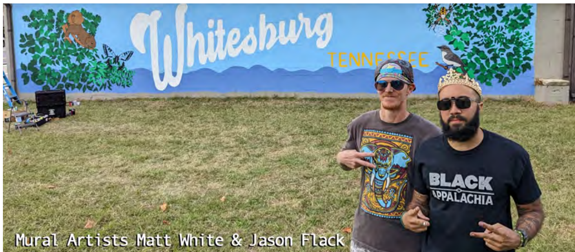
Mural Funding Provided by Tennessee Arts Commission

We're continuing to focus on our physical footprint here in East Tennessee by developing outward facing art & imagery, general construction projects, fish fries & the building out of our bookstore & info shop for the public. We now have a proper clip file & reference book library for visiting researchers, as well as public WI-FI. Fundraising to pay off the mortgage is ongoing, with $46,000 outstanding. Donations to the building fund can be submitted through our website or mailed to: Black in Appalachia, PO BOX 37, Whitesburg, TN 37891.