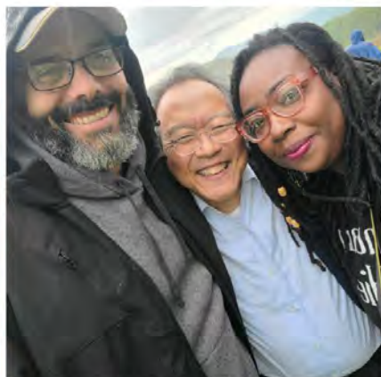
BIA crew w/ Yo Yo Ma, North Carolina