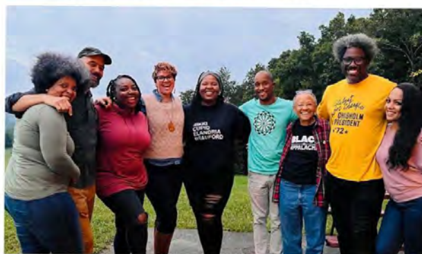
Black in Appalachia taping w/ CNN's United Shades of America, at Highlander Center, New Market